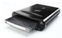
External Iomega REV Drive