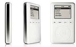
iPod at different angles 5.6 ozs 40GB drive Holds 10,000 tunes

Gee, maybe after this article I can get a job at an Apple store. I know I could sell some iPods.