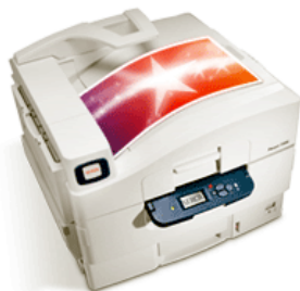
Printed on a Xerox Color Laser