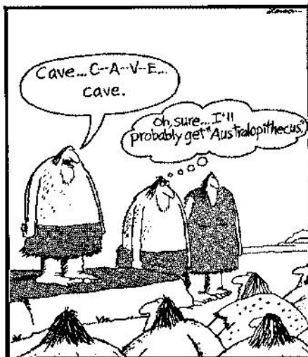
Primitive spelling bees

FINISHED FILES ARE THE RESULT OF YEARS OF SCIENTIFIC STUDY COMBINED WITH THE EXPERIENCE OF YEARS.